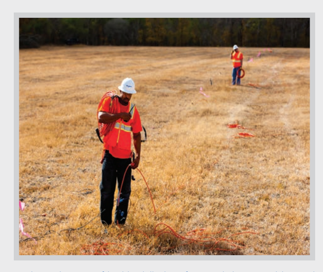
Dedicated crews of highly skilled professionals laying cables and sensors in a star-like pattern.