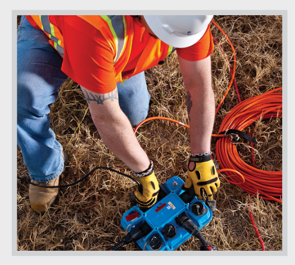
The temporary deployment of cables and sensors leaves minimal disturbance to property and the environment.