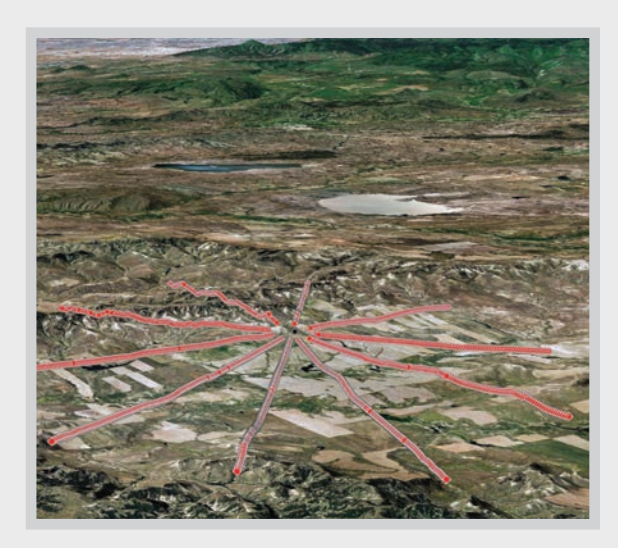
Temporary FracStar® array design depicting sensor placement.